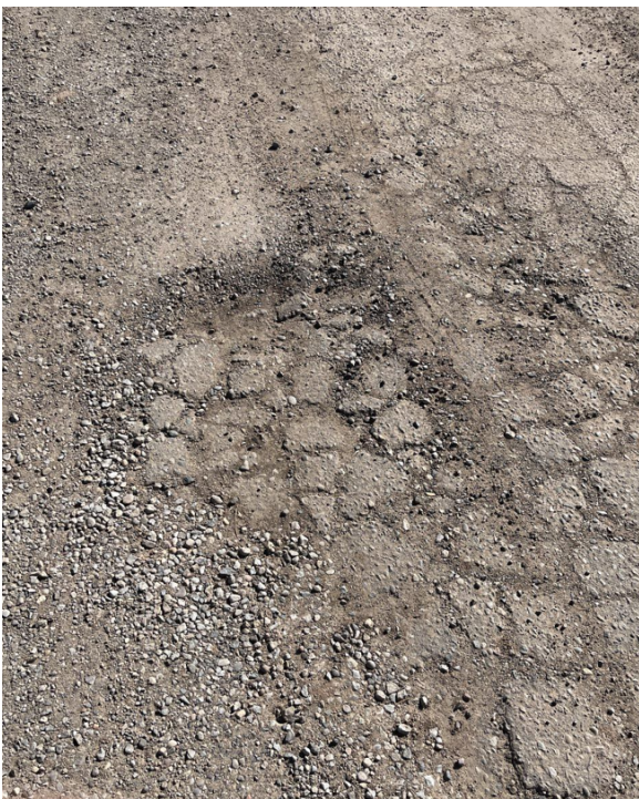
Figure 4: Alligator cracking and subgrade failure