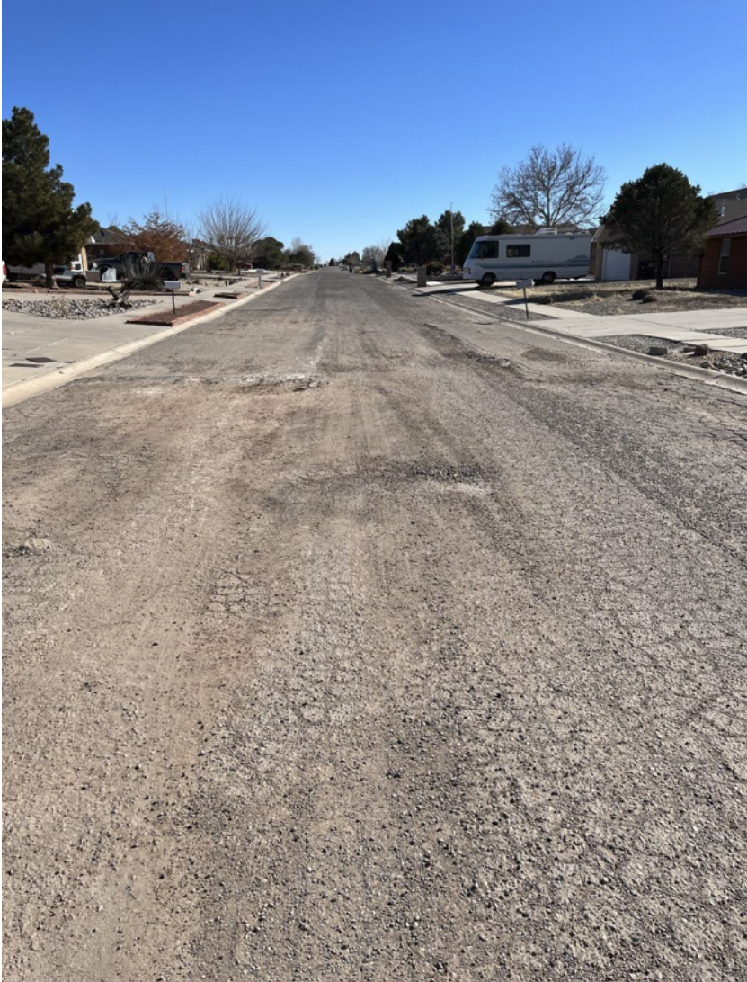
Figure 2: Excessive cracking and subgrade exposure