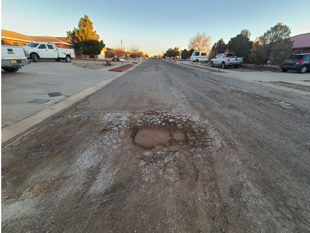
Figure 1: Subgrade exposure

A site review was performed to assess the severity and extent of material and structural distress in the existing pavement. After a careful evaluation, it was determined that the existing pavement has reached its life span and it needs immediate replacement.