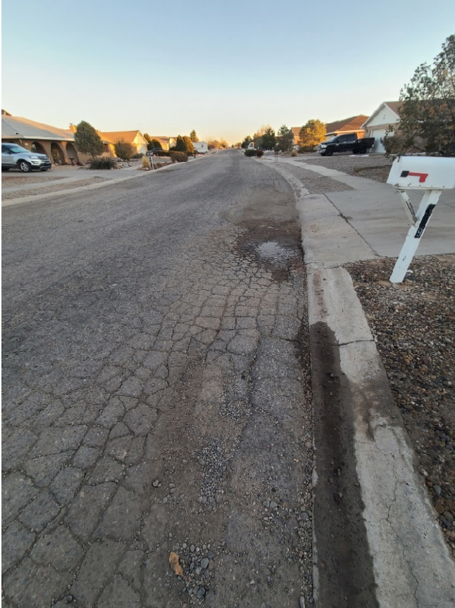
Figure 3: Alligator cracking